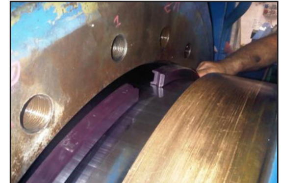
Chesterton 11K set installed in horizontal extrusion press.